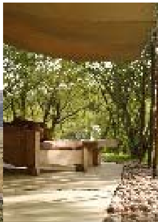
Relax and Enjoy!