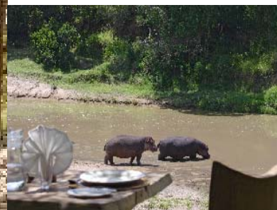
Lunch with Hippo